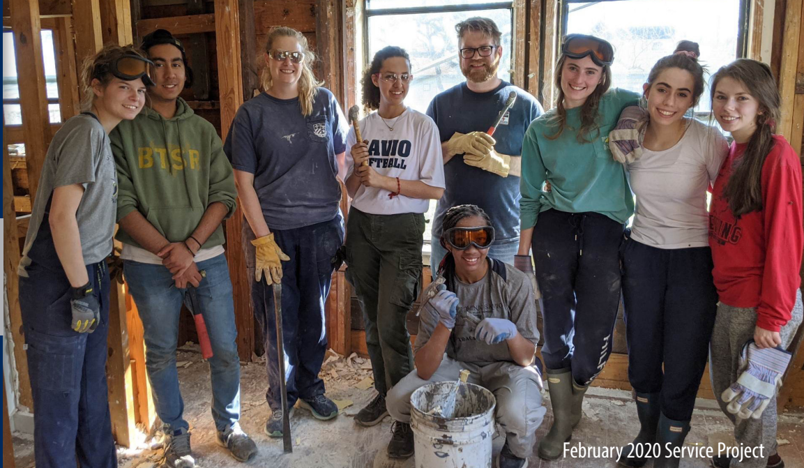
February 2020 Service Project